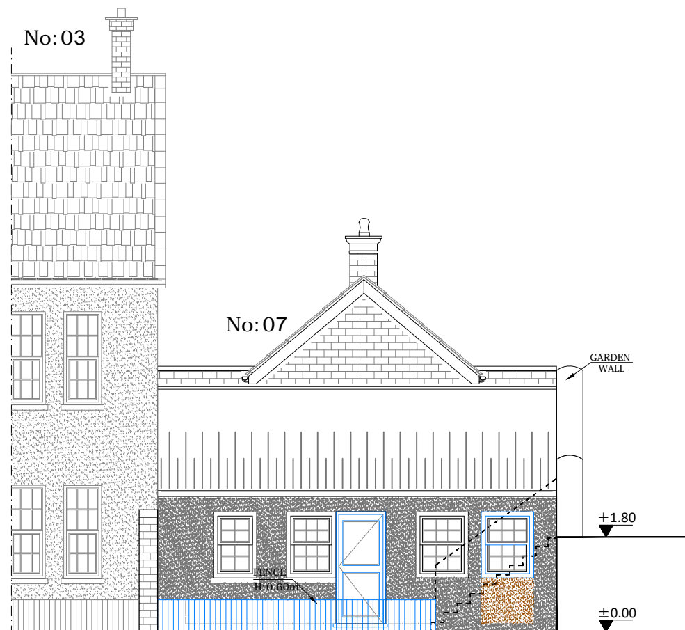
PROPOSED SIDE ELEVATION SCALE: 1/100